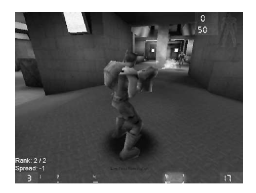
Fig. 1. Unreal Tournament and the Gamebots environment.

and 20% of the total processing time [2]; therefore it is important for the behaviour system to be light in terms of computation time.