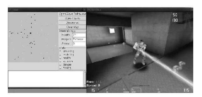
Fig. 3. Interface used to teach the bot: on the right is the normal Unreal Tournament window showing our bot; on the left is our interface to control the bot.

While the previous method of teaching a behaviour works, it deprives the player of the interface he is used to; his perceptions and motor capabilities are mostly